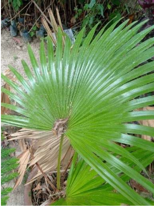
2. Livistona chinensis → Chini Palm