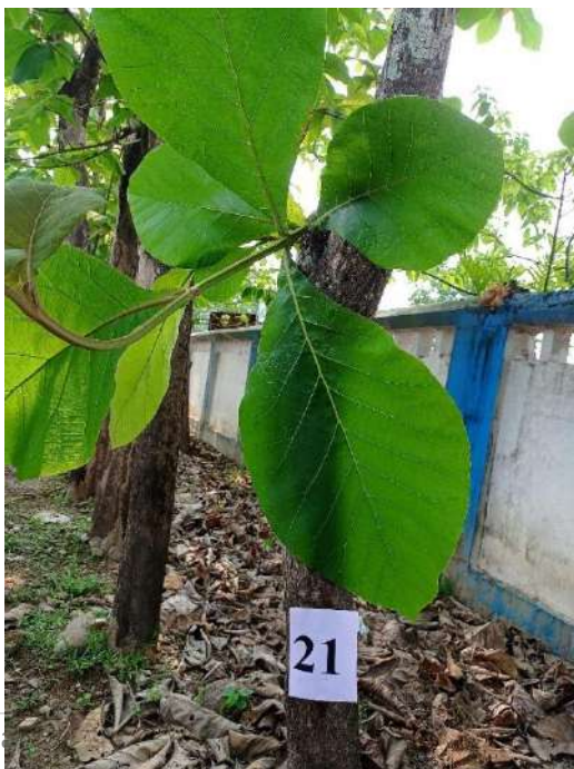
4. Tectoma grandis → Segun