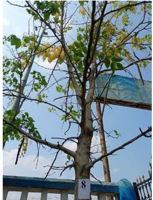
3. Cassia fistula → Bador Lathi