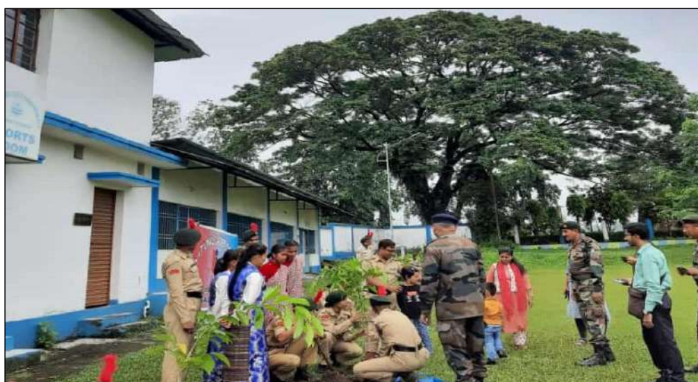
Celebration of World Environment Day on 5 th June in College Campus